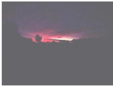
PHOTOGRAPHY MYSTIC @RTN ADITHYA