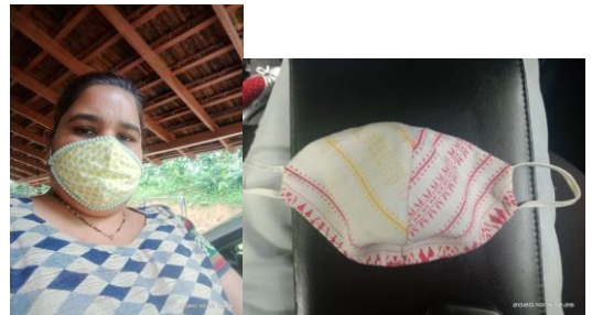
ANN BHARGAVI WITH SELF DESIGNED MASKS

CONGRATULATIONS ANN DIVYA ON A DOUBLE FEAT OF “BATTER AND BEYOND” AND SPRINT IS GIVING SPRINTING GOAL