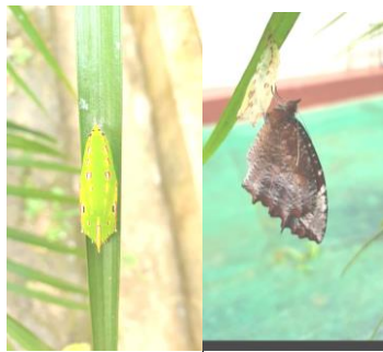
CUCOON TO FLY PHOTOGRAPHY @ANN DEENA